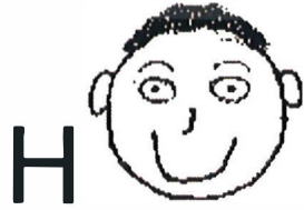
HAPPY HANK (PSALM 1:1-2 "BLESSED")